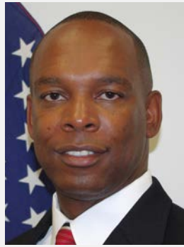
Hawaii Team Leader