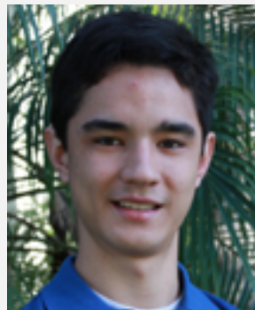
Southern California Special Olympics Athlete