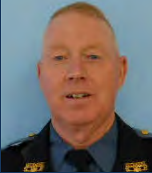
Delaware Team Leader