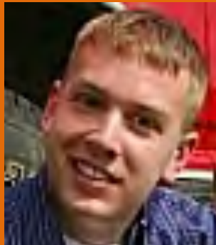
Arkansas Special Olympics Athlete