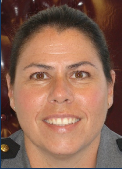
Maryland Team Leader