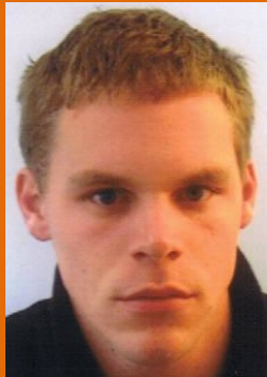
New Zealand Special Olympics Athlete